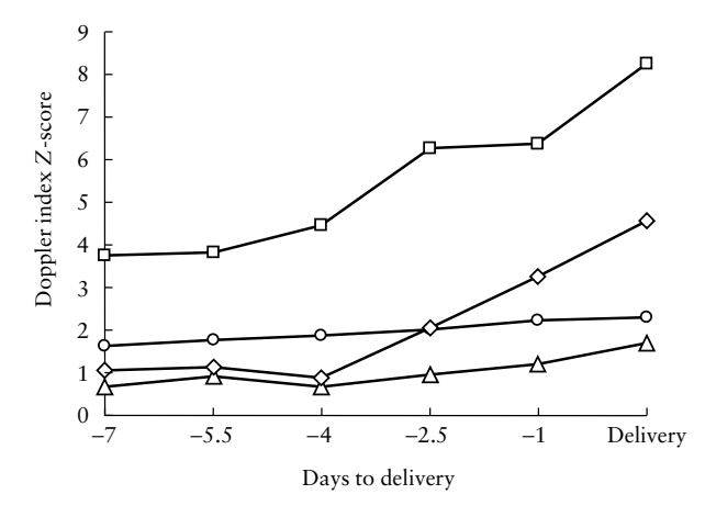
Figure 2 The median delta Doppler indices in the week prior to delivery: umbilical artery pulsatility index ( \Box ), middle cerebral artery pulsatility index ( \bigcirc ), inferior vena cava peak velocity index for veins ( \triangle ) and ductus venosus peak velocity index for veins ( \diamond ). Umbilical artery and ductus venosus indices show a steady parallel elevation, while middle cerebral artery changes are not as marked and those in the inferior vena cava are variable.

By study definition, all fetuses demonstrated decline in BPS significant for every parameter. The exception was heart rate reactivity. Reactive NST increased from the initial 13% to 22.3% of fetuses 1 week before delivery, but declined to 0% by day of delivery (not statistically significant). Decline in other BPS parameters tended to follow Doppler changes. Just 2–3 days before delivery, fetal breathing movement began to