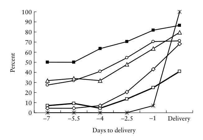
Figure 4 The percentage of abnormal Doppler findings in individual vessels and the incidence of a biophysical profile score below 6 ( \mathbf{X} ) in the week prior to delivery. \blacksquare , umbilical artery absent or reversed end-diastolic flow; \bigcirc , abnormal middle cerebral artery flow; \square , abnormal inferior vena cava flow; \triangle , abnormal ductus venosus flow; \diamondsuit , umbilical vein pulsations. Deterioration of Doppler findings precedes decline in biophysical profile score.

Doppler deterioration and BPS < 6/10 were simultaneous (Figure 4).