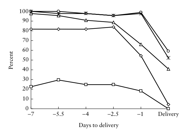
Figure 3 Presence of individual biophysical components during the last week prior to delivery: normal tone (\bigcirc) , normal movement (\mathbf{X}) , breathing (\diamondsuit) , normal amniotic fluid (\triangle) and reactive non-stress test (\square) . All fetuses had a non-reactive non-stress test. Fetal breathing, amniotic fluid volume, tone and movement were sequentially lost prior to delivery.

Three principal patterns of Doppler deterioration were observed. The most common sequence was worsening umbilical artery PI, advent of brain sparing, followed by venous deterioration. Among the 32 (72.7%) fetuses who followed this sequence, 28 completed all three steps, four progressed only to brain sparing. Six fetuses (13.6%) demonstrated the second pattern: precordial venous flows were abnormal for a median of 2 weeks (range, 7–60 days) before brain sparing developed. The third pattern was unusual: four fetuses (9.1%) showed DV abnormality without ever altering cerebral blood flow. In the majority (31, 70.5%) Doppler deterioration was complete 24 h before BPS decline. In the remainder (11, 25%)